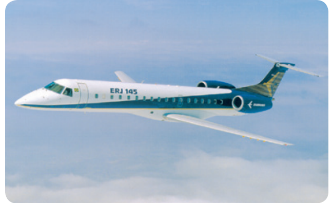
Embraer ERJ 145

Embraer EMB 120 Brasilia, ERJ 135, ERJ 140, ERJ 145 and ERJ 145XR